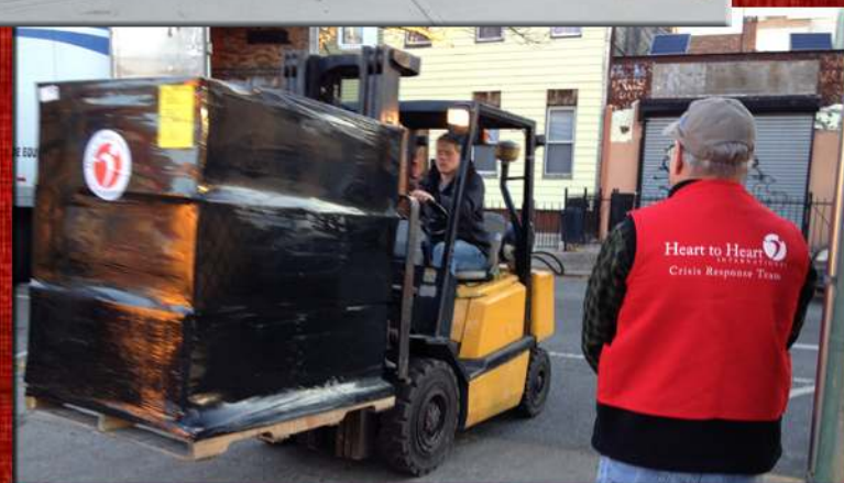
Hurricane Sandy Aid & Relief: The Mobile Medical Unit and supplies arrive in New York